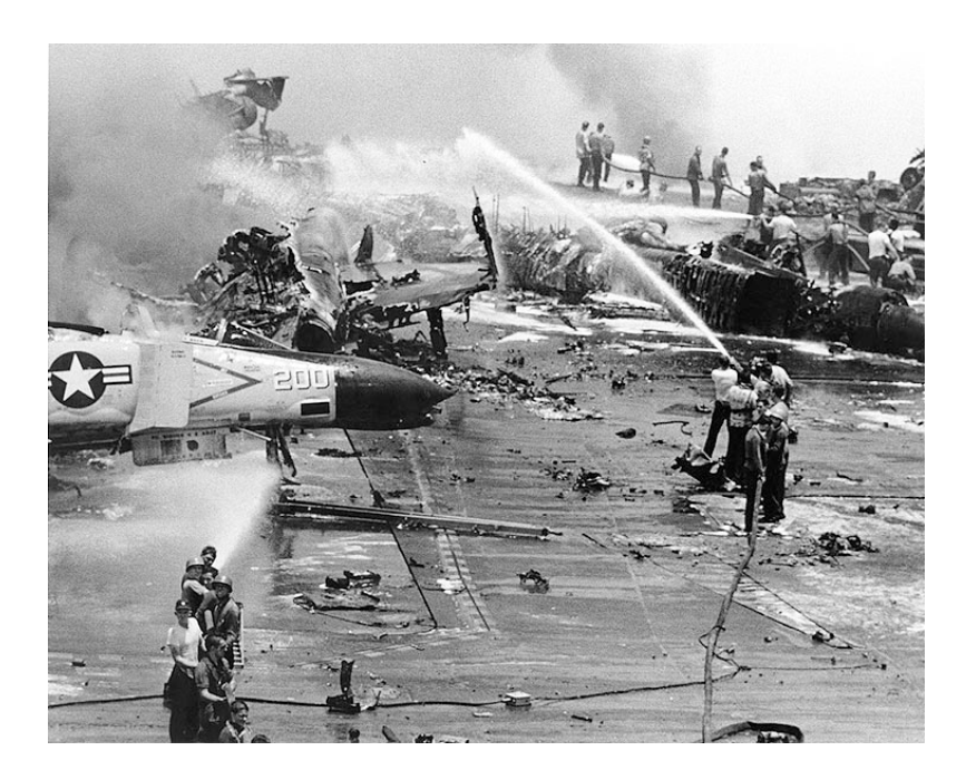
Figure 2-3: 1967 USS Forrestal Fire [9].

and, without warning, a MK-32 "Zuni" rocket was launched, probably due to a power surge when switching from external to internal power. The rocket hit the fuel tank of an A-4E on the other side of the deck, causing it to leak fuel onto the deck of the ship. The resulting fire caused many aircraft to burn and bombs to explode (see Figure 2-3). One hundred thirty-four sailors were killed and 161 more were injured by the fire and explosions. Twenty aircraft were destroyed and the incident caused approximately $72 million in damages to the ship [8].