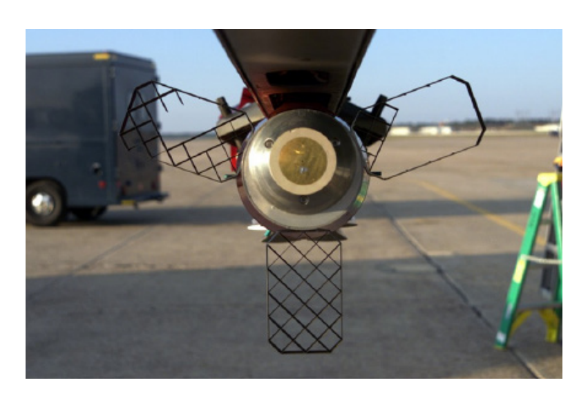
Figure 3-2: Post Flight Inspection [13].

Aerial refueling may be required to complete the profile. If the test aircraft must land for refueling before the profile is complete, the stores should not be removed from the aircraft between flights. Prior to takeoff, screw and bolt-head positions on external panels, as well as internal flight control structures, should be marked to detect movement during flight. Following the completion of FQ and loads testing, the stores must be carefully examined to look for deformation of the store or suspension equipment, broken or bent fins, and any evidence of the store making contact with the aircraft structure or other stores (see Figure 3-2).