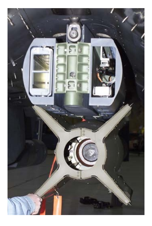
Figure 2-2: Extremely Tight Fit Check [7].

Before attaching the store to the aircraft the results of the mass properties analysis should be used to analyze the attachment mechanism and the clearances with the aircraft and other stores. Often computerized aircraft models are used to predict the store fit with the aircraft. A proper fit and function test is a prerequisite for flight testing. The fit check will determine adequate clearances, functional compatibility, and lanyard rigging as well as verify loading procedures and ensure that store movement will not result in impact with the aircraft or other stores. Functional compatibility should also be checked to determine that the store communicates properly with the aircraft across any data busses, that information from the store is properly displayed to the aircrew, and that aircraft and weapon software is compatible. Note the very tight clearance shown in Figure 2-2. A fit check will normally include a static ejection as well. The static ejection test, usually called a pit test, can be conducted from a rigid test fixture, iron bird, or from the aircraft itself. Neither test will be an adequate representation of the actual loads experienced in flight, but can be useful in building up to flight test and verifying that the hardware works properly.