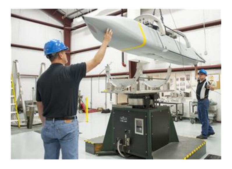
Figure 2-1: Mass properties measurement [6].

The mass and inertial properties of the store are measured to verify that the test store is representative of the operational store and to verify that the modeling and wind tunnel work is applicable to the store being flight tested. Store weight and center of gravity are usually determined by using a mass balance like the one shown in Figure 2-1. The mass properties examination should determine the store dimensions, weight, center of gravity, and inertial properties. When a new variant of an existing store is considered, movement of the center-of-gravity by more than ½ inch, weight changes by more than five percent, or changes in inertial properties of more than 10 percent require a new mass properties evaluation.