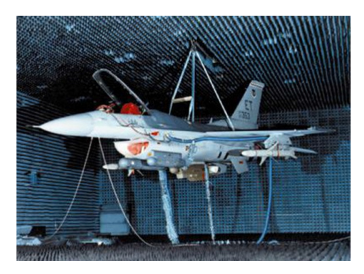
Figure 2-4: F-16 Aircraft preparing for testing in an anechoic chamber [10].