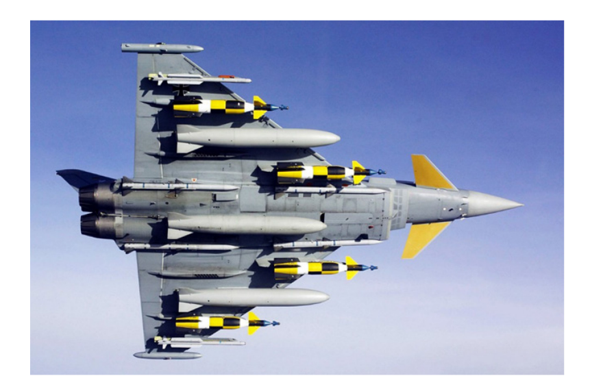
Figure 3-1: Eurofighter loaded with Paveway IV bombs [12].

Aerial refueling may be required to complete the profile. If the test aircraft must land for refueling before the profile is complete, the stores should not be removed from the aircraft between flights. Prior to takeoff, screw and bolt-head positions on external panels, as well as internal flight control structures, should be marked to detect movement during flight. Following the completion of FQ and loads testing, the stores must be carefully examined to look for deformation of the store or suspension equipment, broken or bent fins, and any evidence of the store making contact with the aircraft structure or other stores (see Figure 3-2).